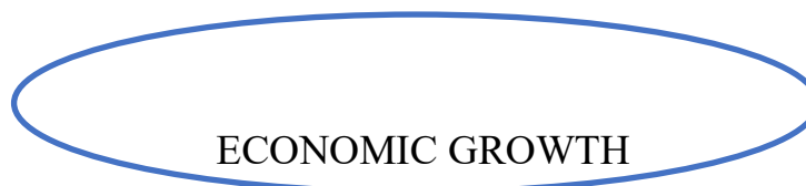
Figure 1. Integrated Fiscal Sustainability Model

The data indicate that state budget revenues increased by more than 103 percent between 2020 and 2024. Tax revenues exhibited a similar growth trajectory, confirming the central role of taxation in financing public expenditures. The relatively stable tax-to-budget revenue ratio demonstrates the effectiveness of revenue mobilization mechanisms and the resilience of the fiscal system.